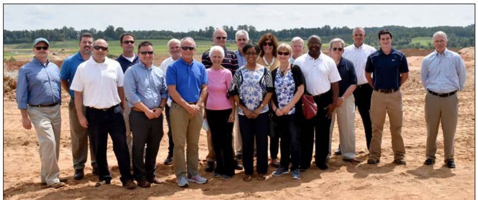
Harvest Foundation staff members and members of the Board of Directors are pictured during a tour of Commonwealth Crossing with Henry County and Martinsville-Henry County EDC officials.

• The project is funded by Henry County, City of Martinsville, Commonwealth of Virginia, the Martinsville-Henry County EDC, Virginia Tobacco Region Revitalization Commission, Virginia Economic Development Partnership, the U.S. Economic Development Administration and Harvest Foundation. 🌟