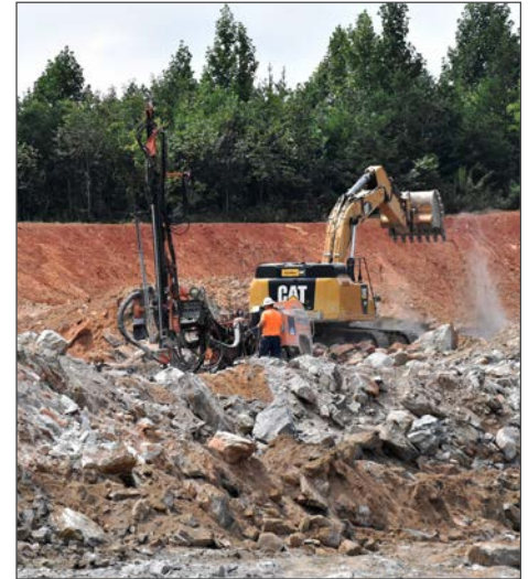
Crews worked on grading lots during August 2016.

In November 2016, Commonwealth Crossing was certified as one of Virginia's first "Business Ready Sites." The Virginia Business Ready Sites Program is a discretionary program established to help state localities develop and market existing industrial