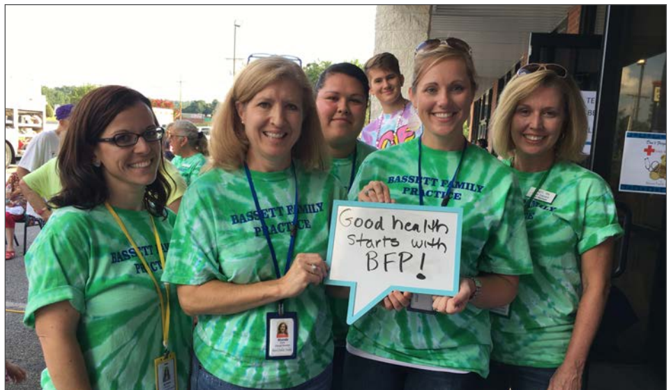
Members of the team at the Martinsville-Henry County Coalition for Health and Wellness are pictured at an open house event for the community.

Focusing on health disparities allows the Coalition to measure efforts to integrate clinical and preventative intervention improving long-term health outcomes across the community. The