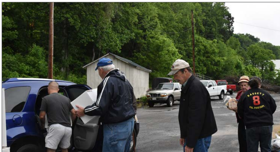
Volunteers at the Henry County Food Pantry load vehicles with boxes of food during the pantry's monthly distribution at the Historic John D. Bassett High School, located on Riverside Drive in Bassett. The pantry distributes food every third Wednesday of the month.

notifications about events including community meals, classes, and job fairs in Martinsville and Henry County. Volunteers have reported that clients have been able to find jobs due to this service. It's also grown to accommodate the CACFP Program (Child and Adult Care Food Program), which provides after school meals and snacks. Five local sites are using the software, which is said to have increased the accuracy of their reports and generated higher rates of USDA meal reimbursement.