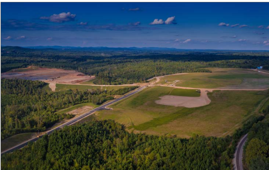
Pictured above is an aerial view of Commonwealth Crossing. (Contributed photo)