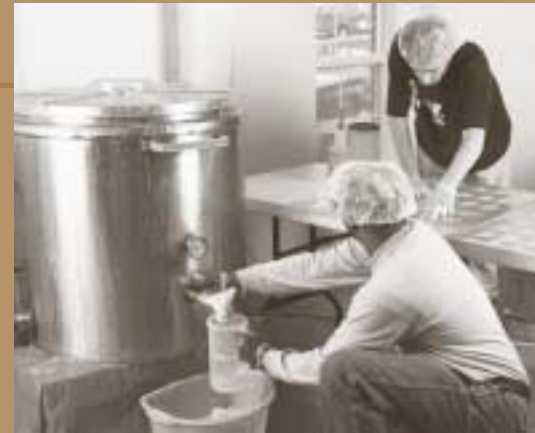
The Brain Injury Service Initiative at the MARC workshop provides jobs for victims of brain injury, like soap-making (shown above).

In its education focus area, the Foundation authorized five grants totaling $487,995 to promote its mission to improve the learning environment for citizenship, academic, and vocational preparedness. The primary education grants were to the City, County, and Carlisle schools for planning to improve math and literacy in every school in the community. Funding was also made available to the United Way to continue locally, the nationally successful Success By Six preschool education program.